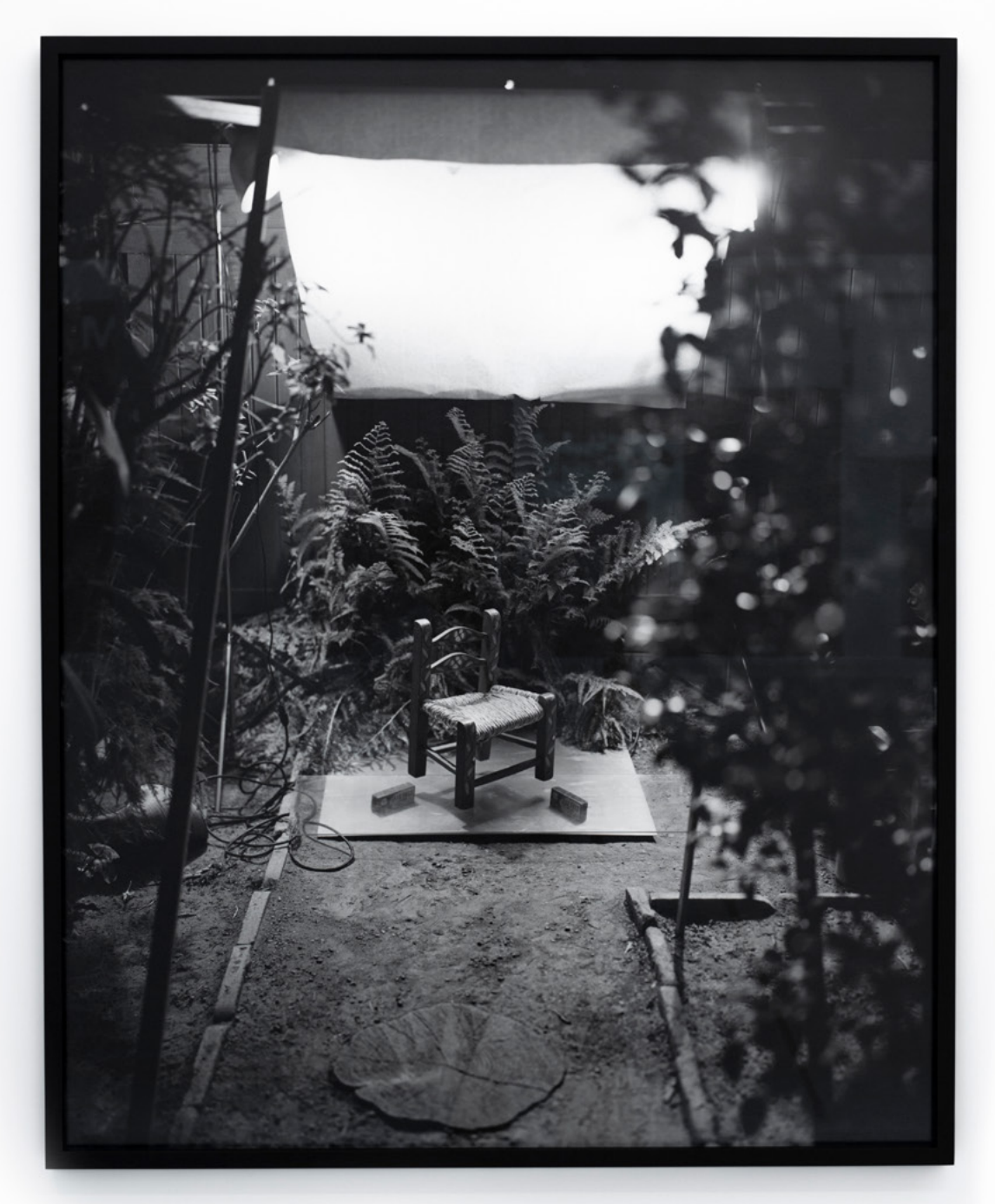
Pigment print, mounted and framed 184.5 x 147.4 cm (paper) / 186.6 x 149.8 cm (framed) No. 4 from an edition of 5