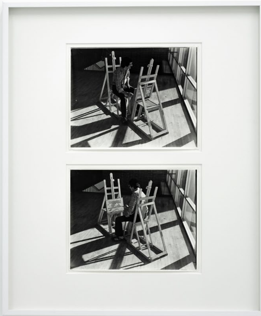
Diptych of vintage silver contact prints, mounted and framed Each 20.1 x 25.3 cm (51.2 x 41.2 cm framed)