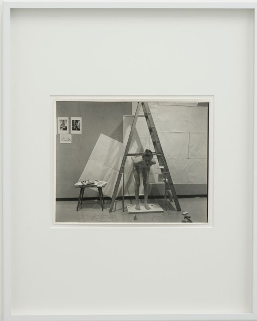
Vintage silver contact print, mounted and framed 2 0.1 x 25.1 cm (51.2 x 41.2 cm framed)