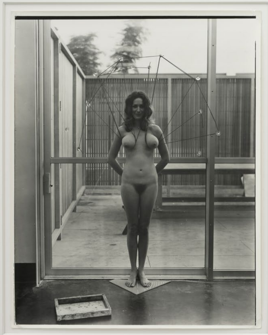
Robert Cumming Effect of the Uplift Bra (1970) Detail