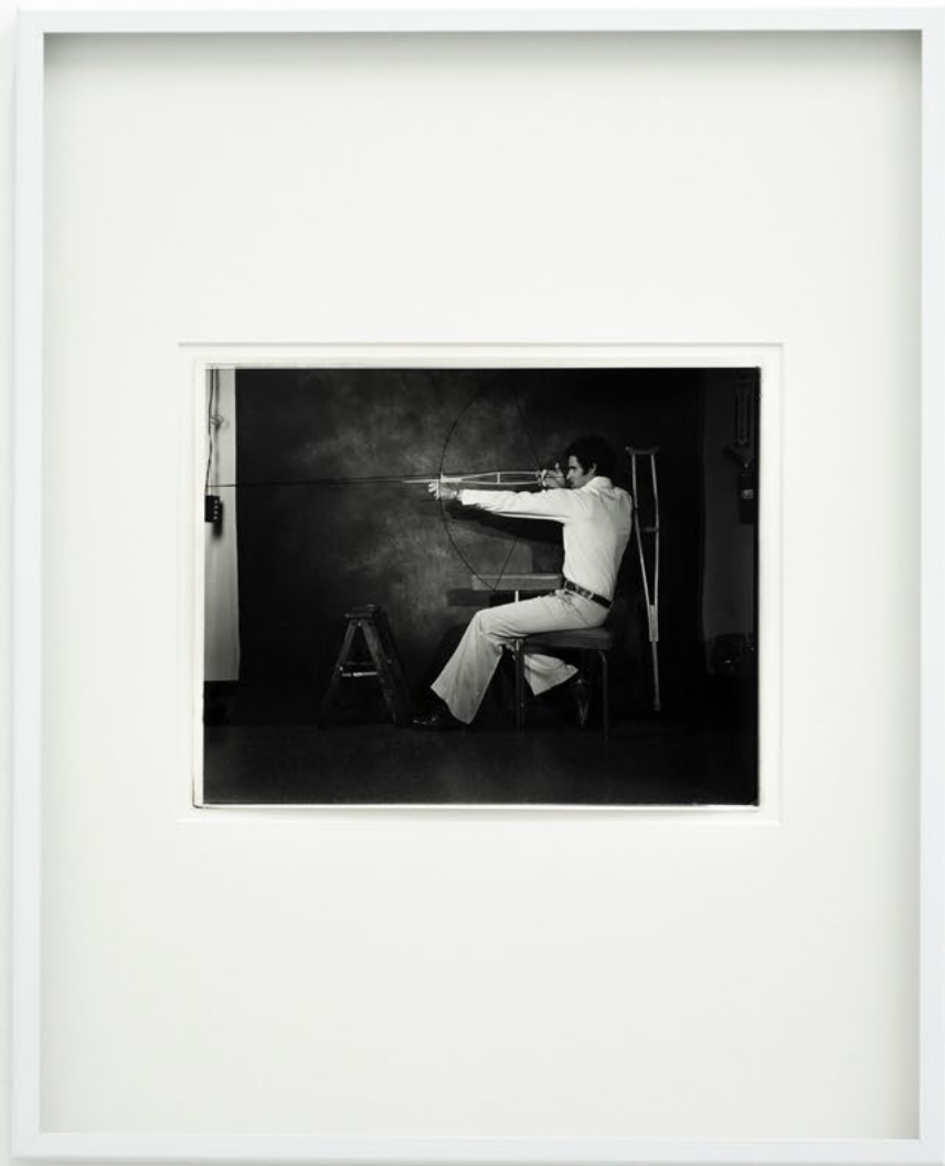
Vintage silver contact print, mounted and framed 20.1 x 25.7 cm (51.2 x 41.2 cm framed)