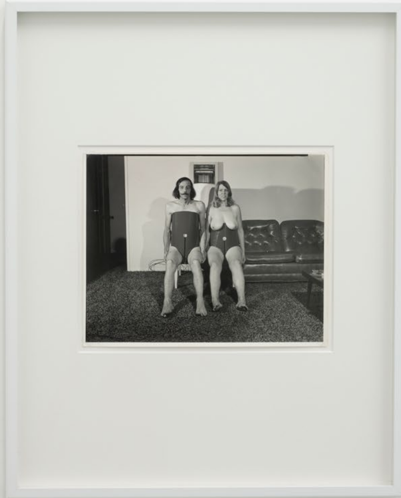
Vintage silver contact print, mounted and framed 20.1 x 25.4 cm (51.2 x 41.2 cm framed)