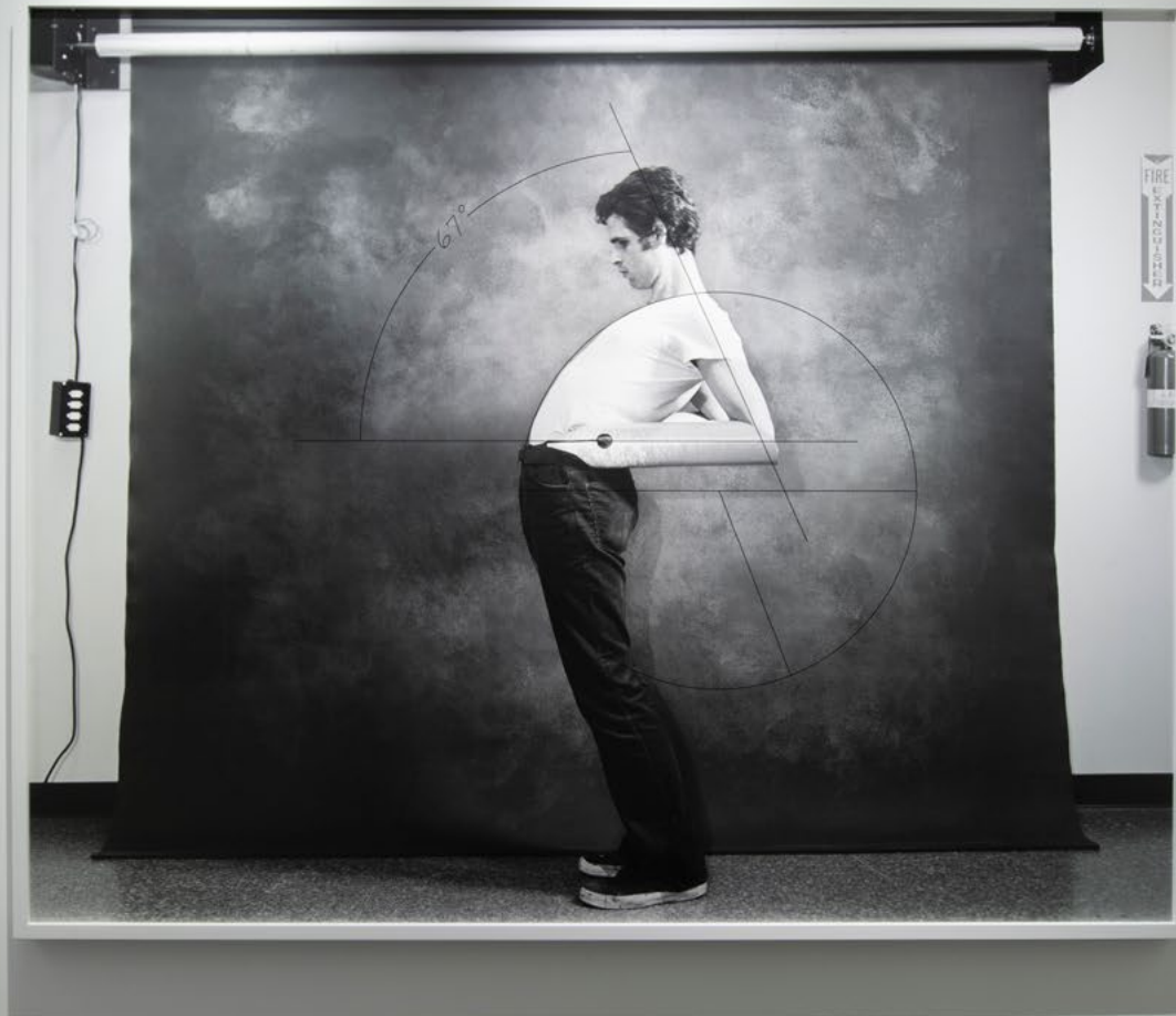
Archival pigment print, mounted and framed 152 x 203 cm (149,8 x 186,6 cm framed) Edition 4 of 5