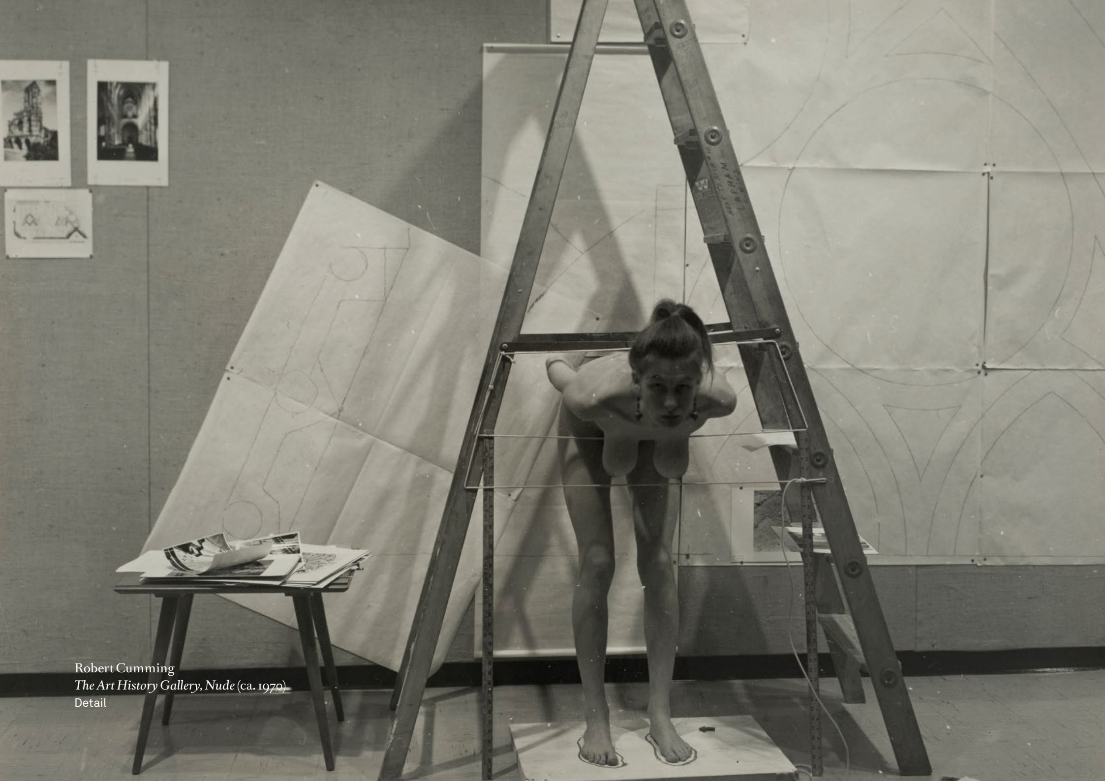
Robert Cumming The Art History Gallery, Nude (ca. 1970) Detail