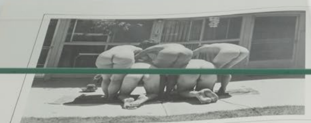
The photograph, the artist's reference to performance's work found in unscripted marketing, artists like pop artist Robert Rauschenberg, and the word "buttocks" are reproduced here.