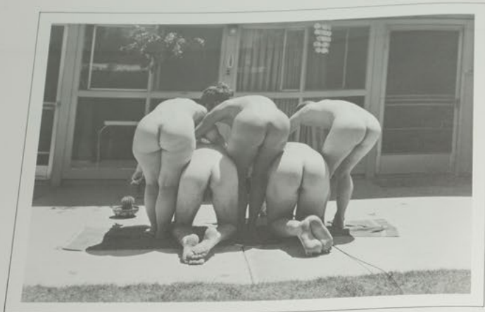
bowing to an appreciative audience.